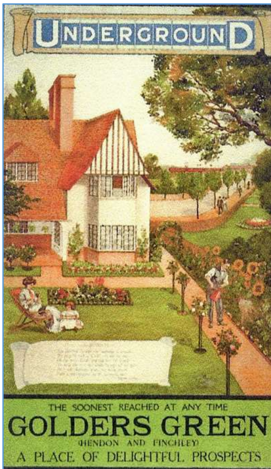
Inter war poster promoting commuting from the suburbs