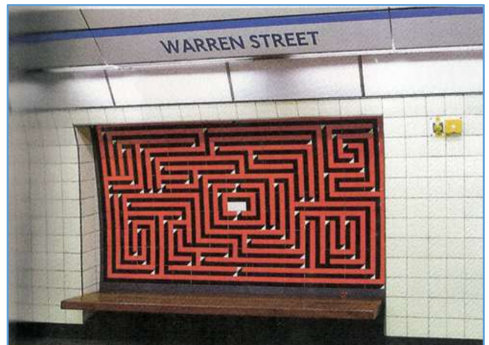
A pattern in tiles suitable for the station

For those who want to discover more about what the u3a has to offer, there are regular Drop-in sessions in the Clarke Foley Centre from 10.30am to 12noon. You can also find us at ilkleyu3a.org or on Twitter and Facebook.