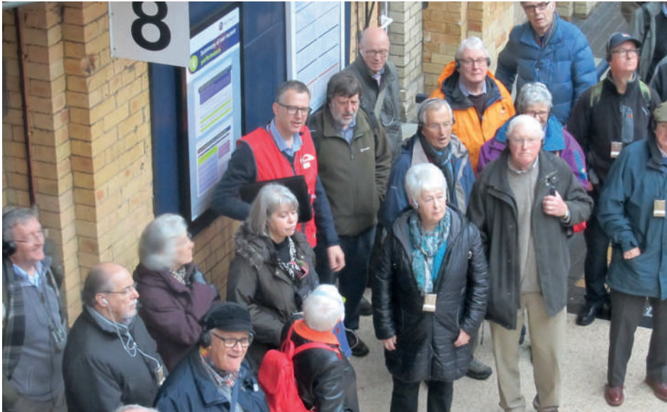
Ilkley U3A Railway Group using the system to hear about the history of York Station