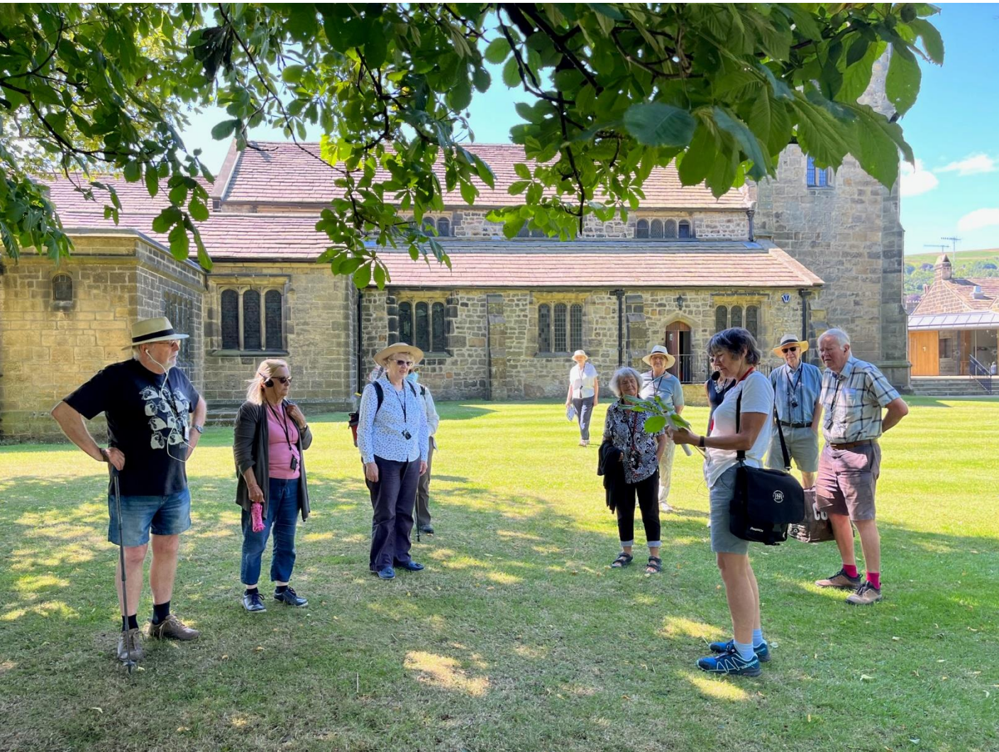
The Horse Chestnut. Not a native tree but introduced into the UK in late 16 th C from Turkey. But how did it get its name? See next picture for a big clue.