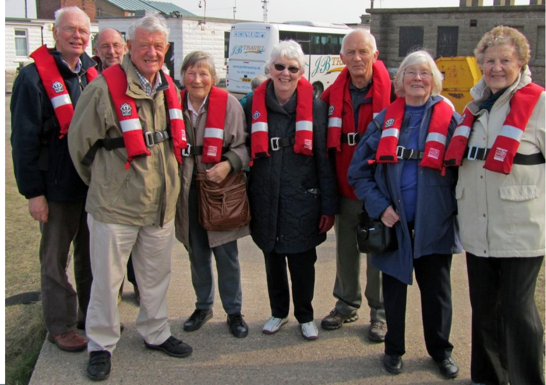
Humber Port Control, Goole Docks and Spurn Point 20th March 2011