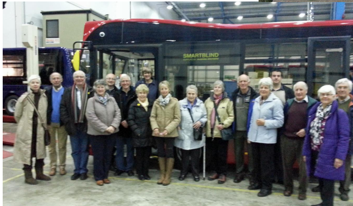
Optare Bus Factory Garforth 8 th April 2014